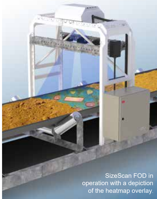
SizeScan FOD in operation with a depiction of the heatmap overlay.