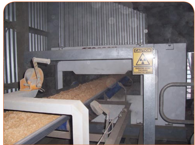
The Geoscan at ABC.

To avoid kiln instability and minimise fuel costs, material composition should be consistent. For